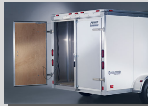
Silver Arrow's integrated aluminum frame results in a straighter, stronger, more precise structure that will continue to look great and perform over time.