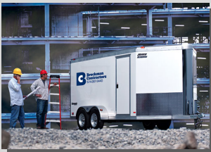
A Silver Arrow is ideal for commercial use. Shown is model SA719TA2.